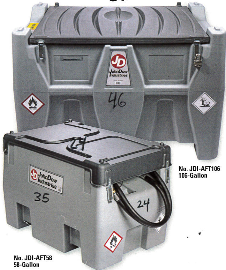
No. JDI-AFT106 106-Gallon