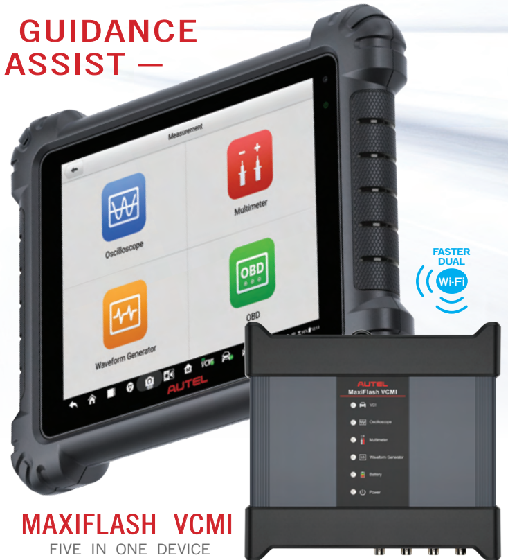
MAXIFLASH VCI FIVE IN ONE DEVICE