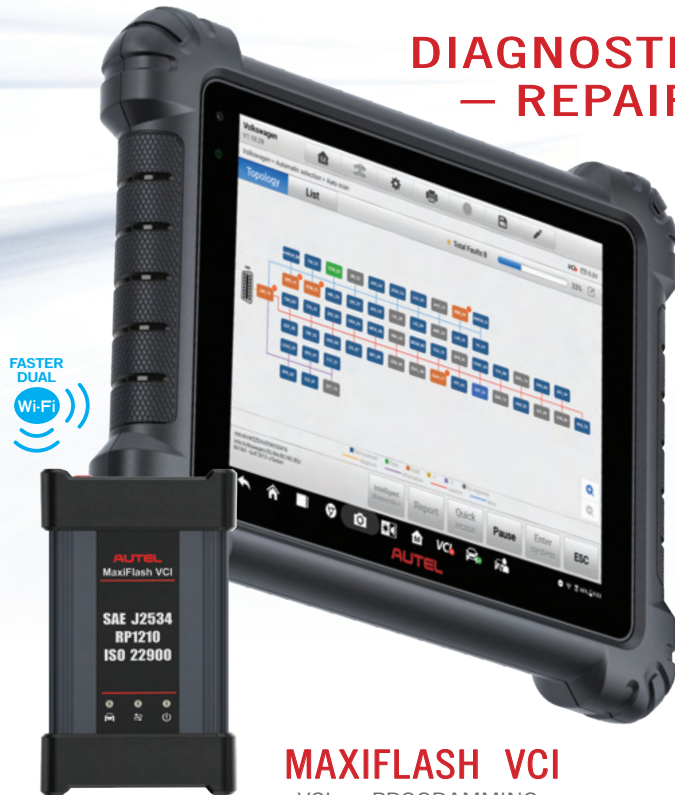
MAXIFLASH VCI VCI + PROGRAMMING